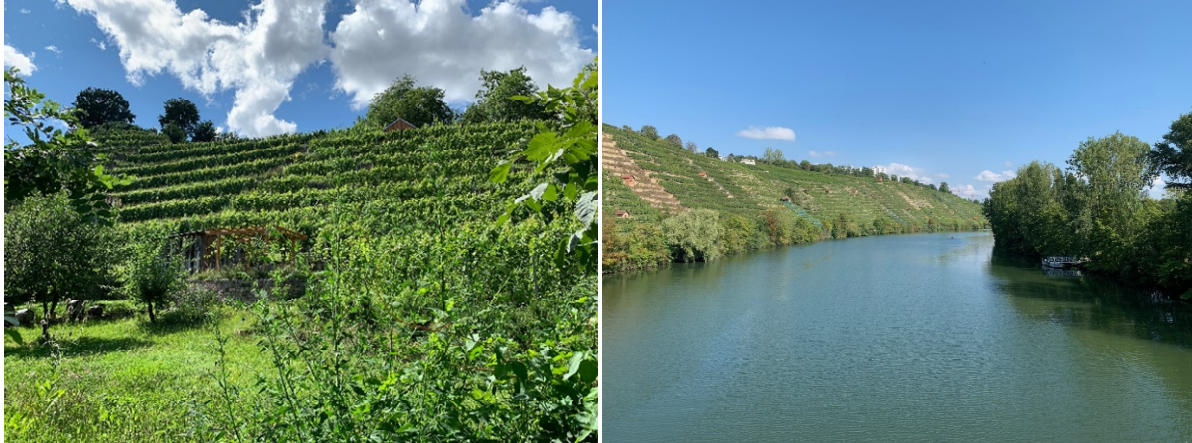
Cooperative's Vineyard – Neckar River

Please join us on Saturday, September 13, 2025 for a visit of a Wine Fest and a private Wine Tasting for our Club, hosted by our friends of the wine cooperative "Steiler Zucker" in their private terraced vineyard on the Neckar River at Max-Eyth-See, Stuttgart-Mühlhausen.