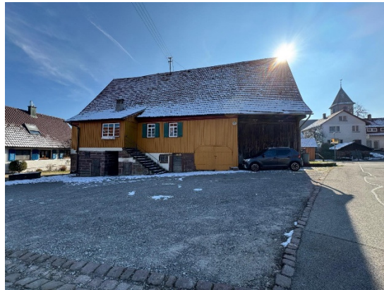
Church and Farmhouse Museum

The historic Martinskirche (St. Martin's Church) was officially documented first in 1342; however the Church Tower dates back to around 1200, the nave and choir to 1250-1300. The church was started in late Romanesque style and was later converted to late Gothic style. The historically most valuable artistic items are murals that were restored in the last century, they had been hidden or painted over for centuries.