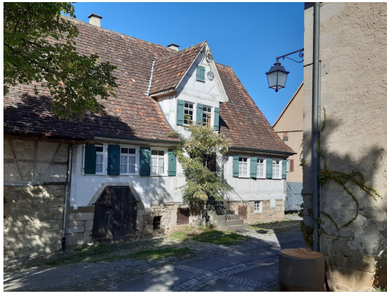
Zeeb House next to Keltermuseum

Please join us on Saturday, November 18, 2023 for a visit of the Keltermuseum in Unterjesingen near Tübingen at the small river Ammer. Afterwards we will enjoy a winetasting and have dinner in the Besenwirtschaft „Enzbach“ in Unterjesingen (for further details see map on page 2).